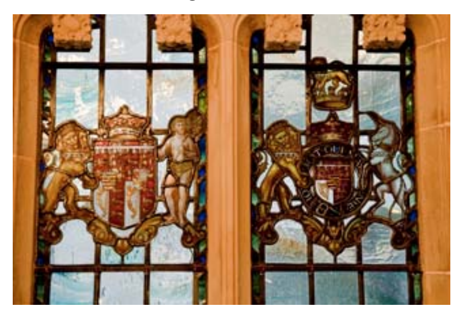
Emblem - Prince Arthur of Connaught: The arms of the United Kingdom with over all a Label of five points Argent charged on the centre and outer points with a Cross of St George Gules and on the two inner points a Fleur de lis Azure, and inescutcheon of Saxony

Emblem - Princess Arthur of Connaught (H H Princess Alexandra, Duchess of Fife): Impaled with the arms of Prince Arthur of Connaught, the Royal Arms, differenced by the label and upon an inescutcheon the quarterly coat of Duff, the inescutcheon being surmounted by the coronet of a Duchess of the United Kingdom, and the lozenge itself being surmounted by the coronet of a Princess of the rank of Highness. The dexter supporter is the Royal Lion of England crowned with the lastmentioned coronet and charged with the label as in the arms. The sinister supporter is a savage taken from the supporters of the late Duke of Fife.