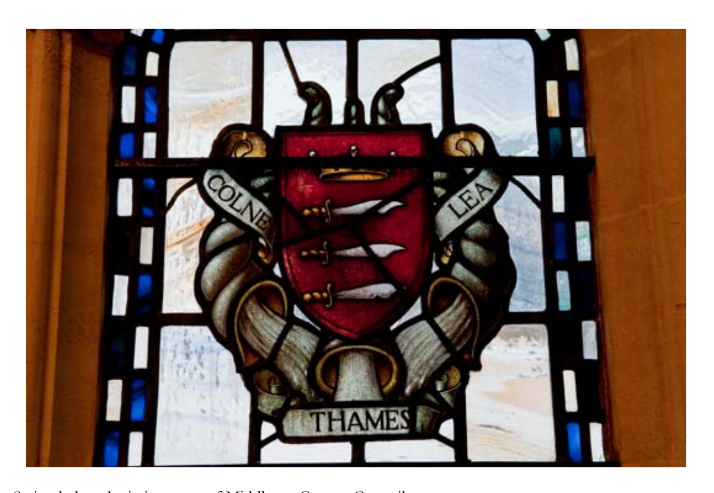
Stained glass depicting arms of Middlesex County Council