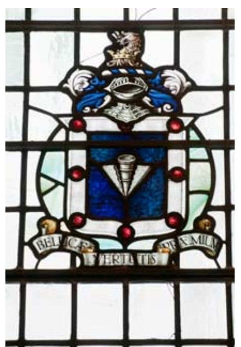
Sessions from 1908 to 1934.

Shield: Azure a pheon argent, on a bordure or, eight torteaux